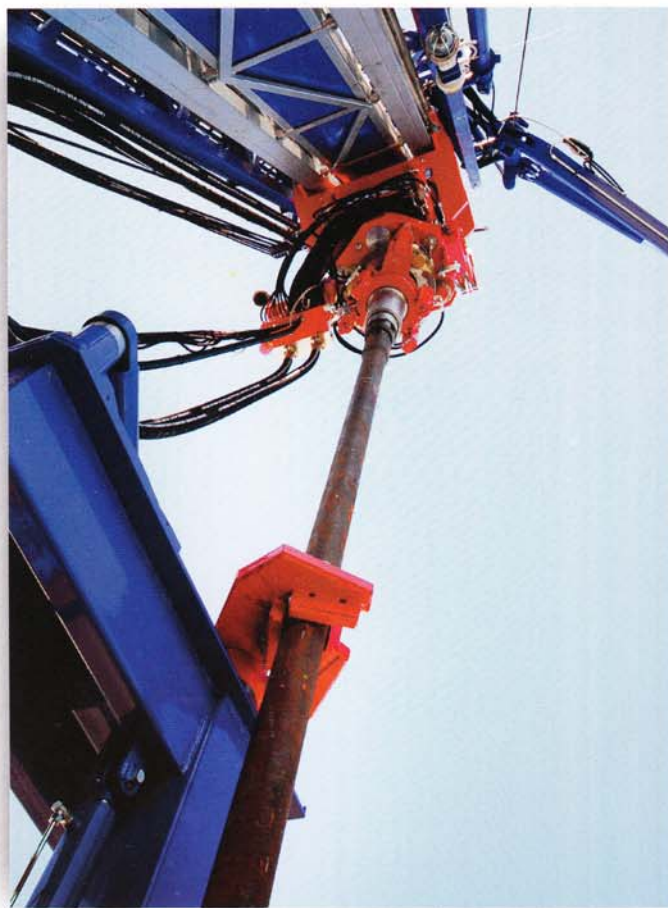
Pipe Loader DS 205 - Zaab Group