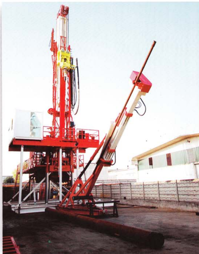
DS 205 Tiger Rig - Drill Pipe Lifting - Heart Land Drilling