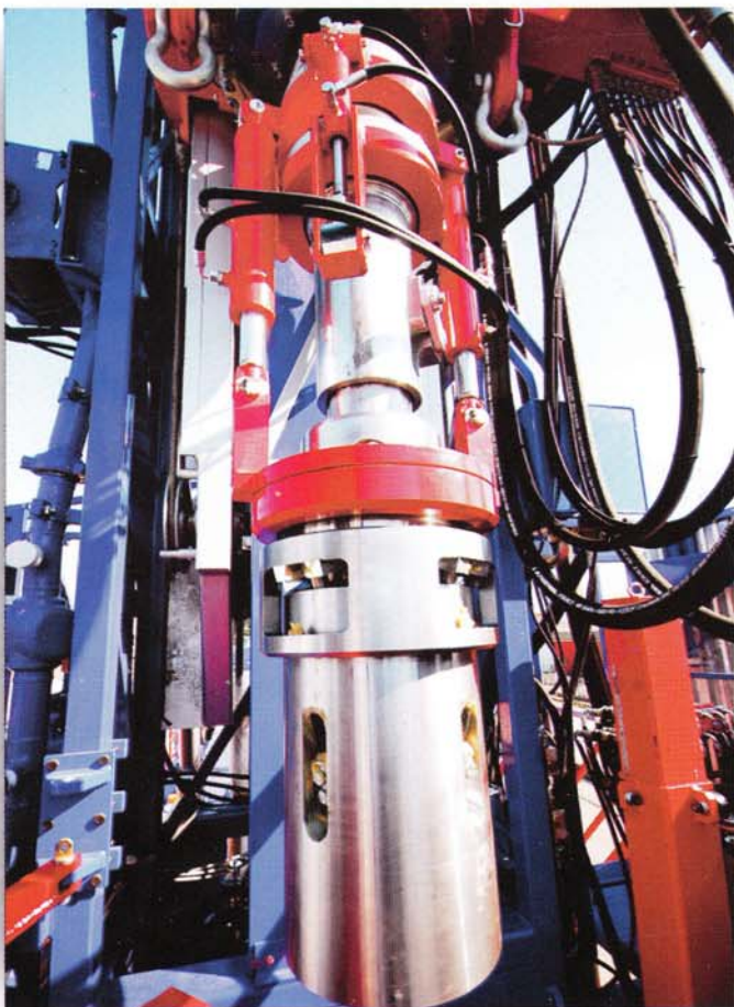
WEI DS 205 - Drill Pipe Elevator - Zaab Group