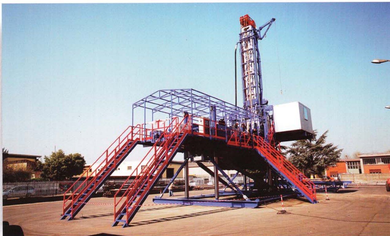
DS 205 Drilling Rig - Zaab Group

The rig is also supplied by the hydraulically operated semi-automatic drill pipes manipulator, that feeds a 5" drill pipe R3 in 28 seconds and does the complete operation of lifting – connecting drill pipes in 60 seconds.