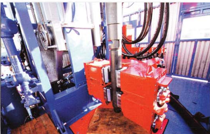
WEI DS 205 - Power Tong - Zaab Group

W.E.I. has, since its creation, presented itself as an industrial organisation resulting from thirty years' experience in constructing drilling rigs and, equipment for drilling.