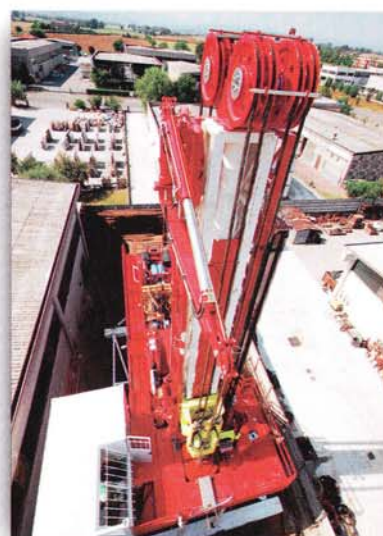
DS 205 SERIES HYDRAULIC DRILLING RIGS