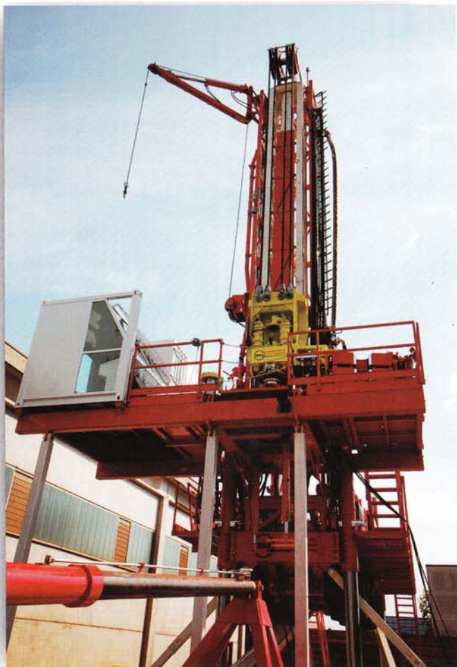
DS 205 Tiger Rig - Rig up - Heart Land Drilling

W.E.I. manufactures these hydraulic drilling rigs seeking to achieve all customer needs and desires.