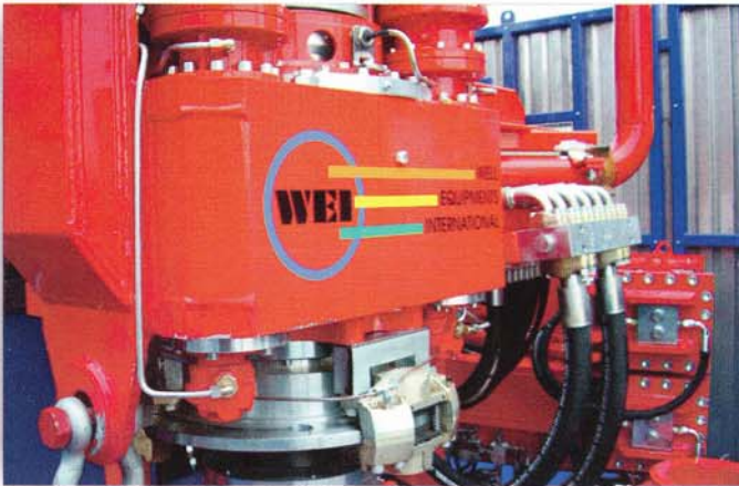
WEI DS 205 - Top Drive - Zaab Group