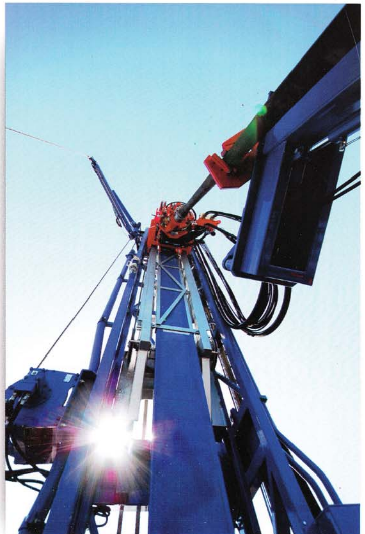
WEI DS 205 - D.P. Manipulator - Zaab Group

W.E.I. continues to look ahead, as it has done in these last ten years, by seeking to create ambitious projects and investing in advanced technology and highly trained personnel.