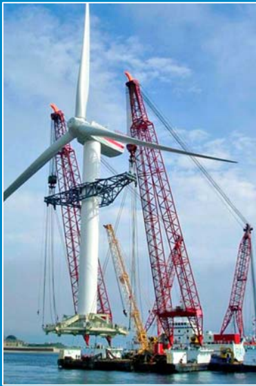
Heavy Lift Vessel Rambiz