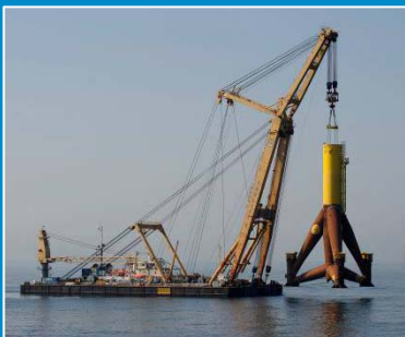
Floating Sheerleg Taklift 4