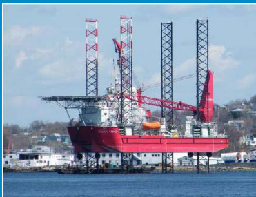
Jackup Vessel Kraken