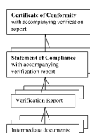
Figure 1 Document hierarchy for certification