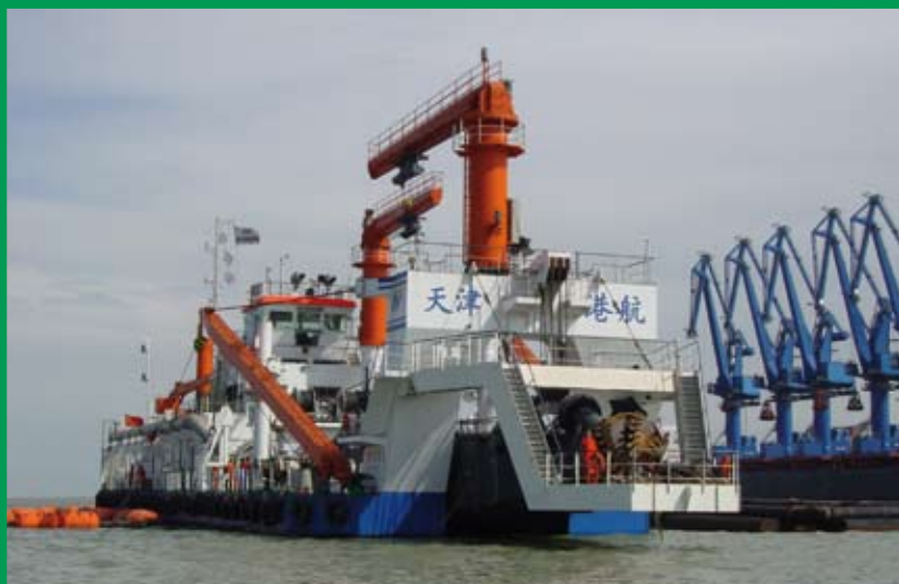
GANG HANG YUN 8 HAO

In 12 months' time the BEIYA 1 HAO had a production of over 10 million m 3 . The dredged material was silty sand that had to be pumped over 6km. The average dredging depth was about 20 meters. The client remains very enthusiastic about the performance of the BEIYA 1 HAO.