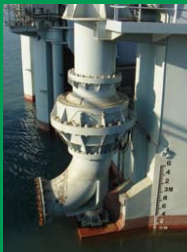
IHC swivel unit of the BEIYA 1 HAO

The pumping hearts of the IHC 7025MP cutter suction dredger are two high-efficiency dredge pumps, one single