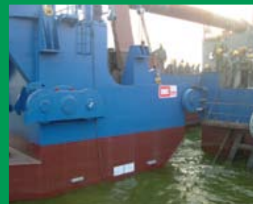
Spud carriage GANG HANG YUN 8 HAO

The IHC 7025MP can be delivered with two different types of cutter heads for different soil conditions. For soft soil an IHC cutter head is delivered with flared teeth, for compact sand and soft rock a cutter head with narrow teeth is provided. A special advantage of this dredger is that it can also be equipped with an IHC dredging wheel. This dredging wheel is interchangeable with the cutter ladder lower piece and enables dredging of sticky clay with a minimal investment. All existing IHC 7025MP dredgers can be equipped with a dredging wheel, making it a versatile piece of equipment suitable for various soil conditions.