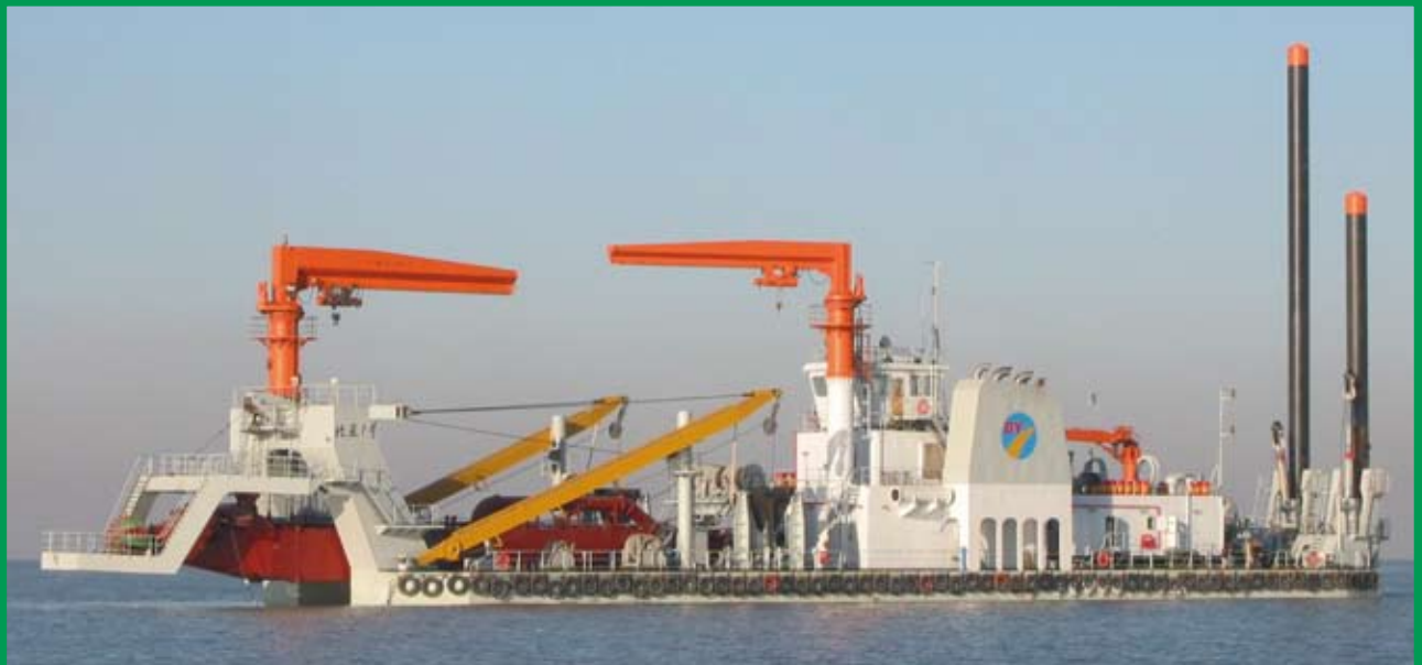
BEIYA 1 HAO

The market trend in China to go for an increase in scale of dredgers first became apparent in the mid nineties with the new building of cutter suction dredgers for a Chinese Waterway Bureau. These dredgers were designed for a nominal production of 1750m 3 /hr and they were the first dredgers in China to be equipped with spud carriers. The submerged dredge pump application was considered optional and was realised at a later stage. It was the prelude to a change in the market from small-scale dredging to operations at a large to huge scale. The trend can be described as: large dredging depth; great discharge length; high production output and sufficient accommodation for 24 hours operation and a sturdy seaworthy hull allowing for bad weather conditions.