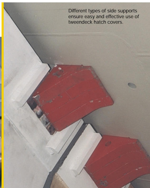
Different types of side supports ensure easy and effective use of tweendeck hatch covers.