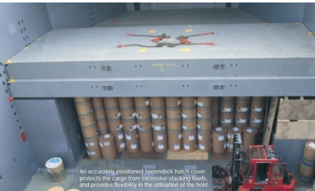
An accurately positioned tweendeck hatch cover protects the cargo from excessive stacking loads, and provides flexibility in the utilisation of the hold.