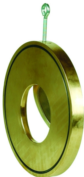
Fig. 69 Wafer type check valve

Econ® zinc free bronze wafer type swing type check valves with aluminium bronze disc, disc and flange sealing by NBR O-ring, pressure rating PN 10/40, suitable for fitting between flanges rated DIN PN 10/16, very short Face To Face, low weight and low pressure loss. Suitable for horizontal and vertical (rising flow) installation.